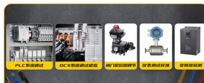
SUITABLE FOR VARIOUS WORKING CONDITIONS