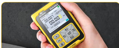
TAKE IT WITH YOU