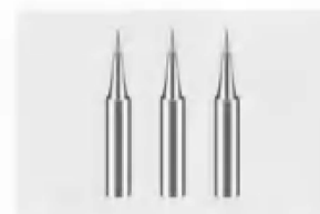
900M soldering iron tip