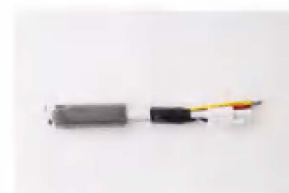
BK853S heating core