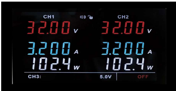
3 CH outputs, High precision Display