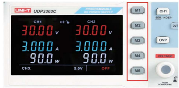
Five sets of settings to save and recall